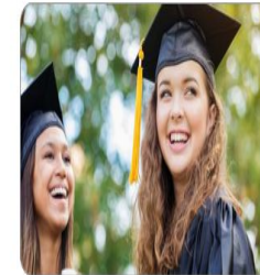
College Success Skills