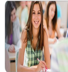
Core English Skills