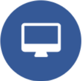
Tech & Internet Access