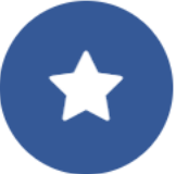
Clothing, Diapers, Etc.