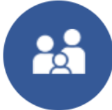
For Youth & Seniors