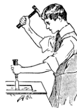
But still working