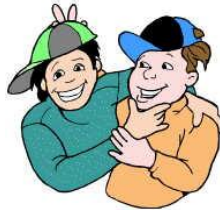
No Best Friend