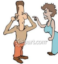
No girl would date him