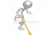
Walked with a cane