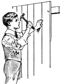
A carpenter at 21