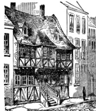
"Anything Is Possible"