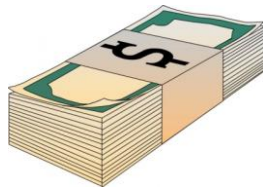
A lot of money, rich