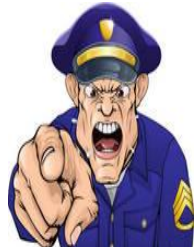
Police- Move it