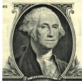
George on the one dollar bill

George Washington was the first president of the United States of America. Because of his honesty, Washington is and was one of the most admired American presidents.