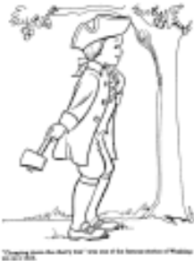
George and a hatchet